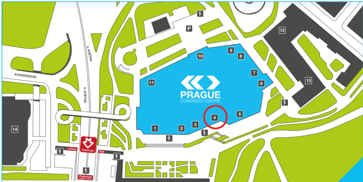
Map: entrance gate 4 to the Prague Congress Centre