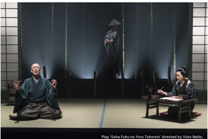
Play 'Soha Fuku no Yoru Tokoroni' directed by Yuko Naito

While fully integrating climate justice principles into one's own activities may seem daunting at first, and indeed could require long-term development, it should be noted that many performing arts organisations are already revising their practices from the perspective of environmental sustainability or from that of social justice (through practices which, depending on the context, may be termed 'equality, diversity and inclusion' or similar terms).