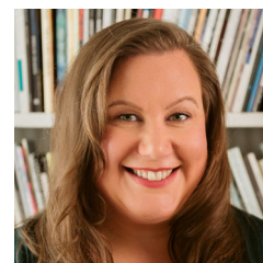
Emmi Jäkkö Lukukeskus, Finland